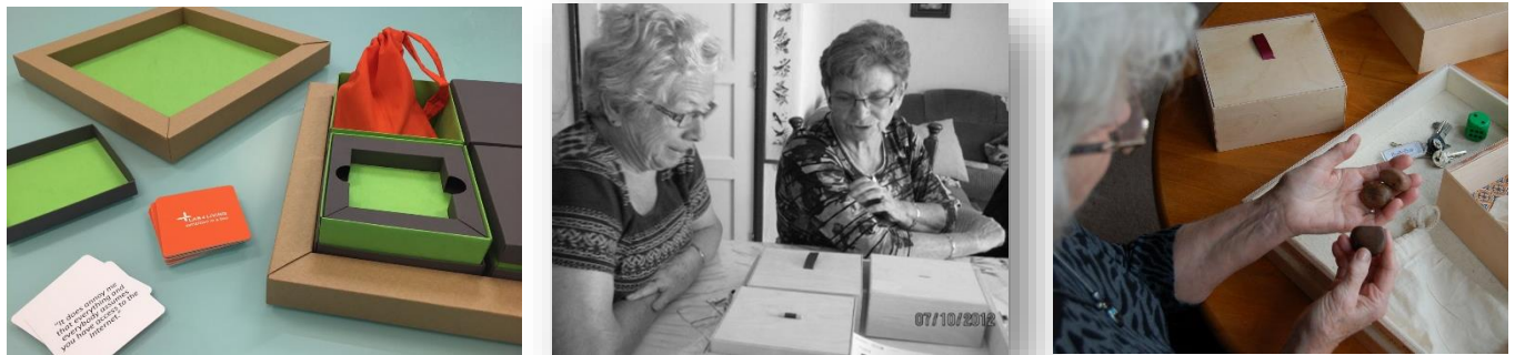
Figure 2 exhibition in a box and user workshops